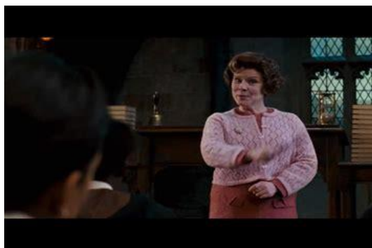
Dolores Umbridge, the High Inquisitor, in Harry Potter and the Order of the Phoenix